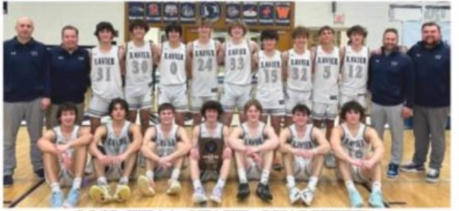
2021 WIAA STATE QUALIFIER 014, 2015, 2016, 2017, 2015, 2019, 2021, 2022, 2023, 2024 Conference Champions!

»Passing and Catching » Shooting Fundamentals » Footwork and Finishing » Defensive Basics » Ball Handling » Offensive Movement