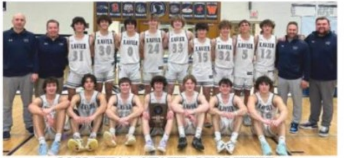
2021 WIAA STATE QUALIFIER 14, 2015, 2016, 2017, 2015, 2019, 2021, 2022, 2023, 2024 Conference Champions!

»Passing and Catching » Shooting Fundamentals » Footwork and Finishing » Defensive Basics » Ball Handling » Offensive Movement