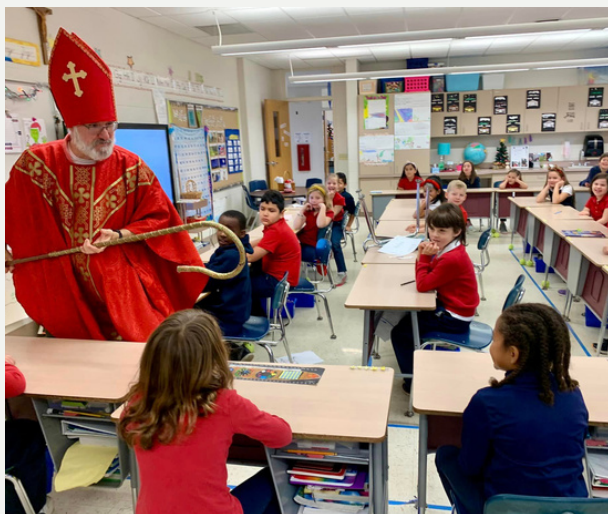
St. Nick 2022