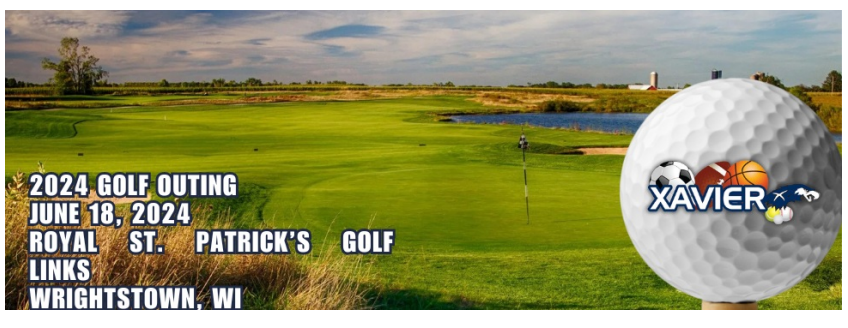
2024 Xavier Booster Club Golf Outing!