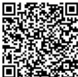
TABLE SPONSORSHIPS AVAILABLE STARTING AT $100 - SEE REGISTRATION FORM FOR DETAILS

PLEASE RESERVE YOUR TICKETS BY SCANNING THE QR CODE AND FILLING OUT THE FORM